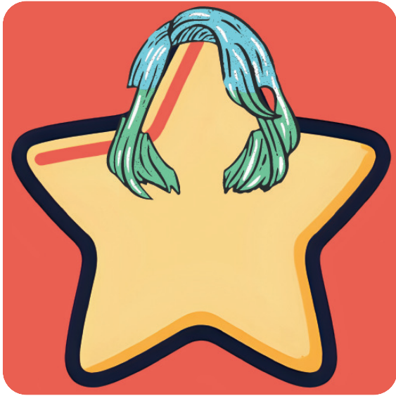
SeeSee January 2026 Left