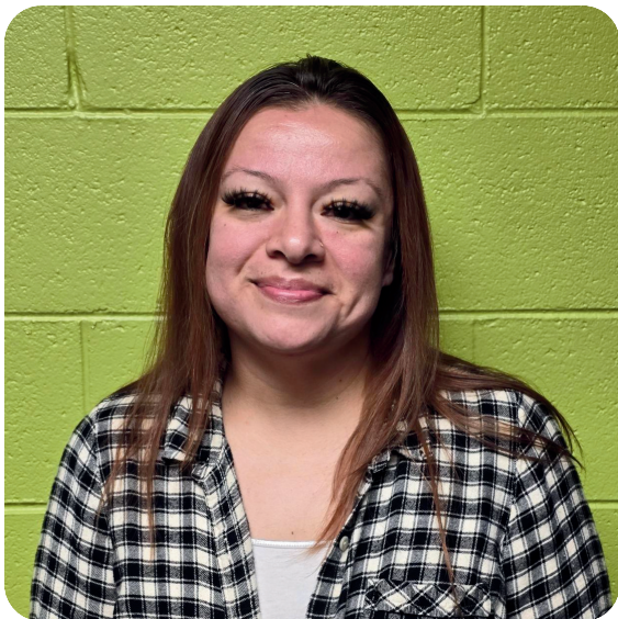
Bam March 2026 Left